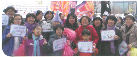
2009 International Women's Day Event