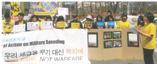
2012 Global Day of Action on Military Spending