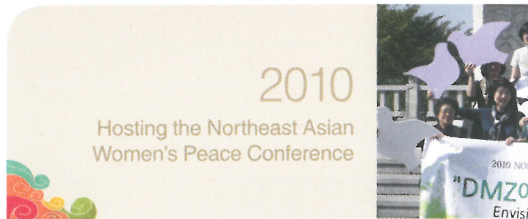
2010 Hosting the Northeast Asian Women's Peace Conference