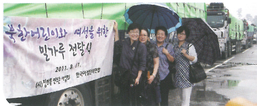
2011 Food aid to North Korean Children & Women